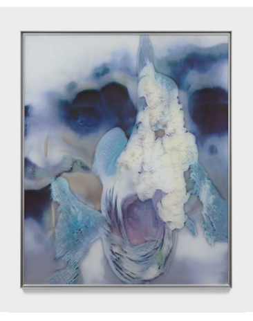
Elysia Chlorotica, 2019. Kelp, emulsified fuel, glycerin, crepeline, acrylic, LED, animatronic insects. 127 \times 66 \times 66 cm. Courtesy the artist and Gladstone Gallery

Anicka Yi, tRbLtS\bar{n}MLt\bar{n}KbL\bar{n}t , 2022. Acrylic, UV print, aluminum artist's frame. 170,8 × 140,3 × 3,8 cm. © Anicka Yi. Courtesy of the artist and Gladstone Gallery. Photography by Tom Powel Imaging