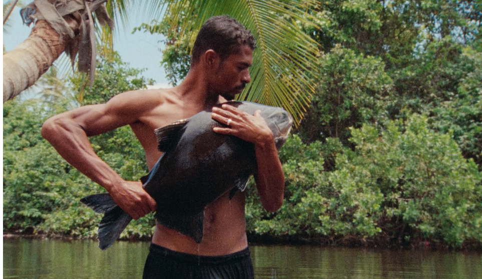
Film still. 16mm film still digitised in HD format. 38 min. Pinault Collection © Jonathas de Andrade. Courtesy of the artist

Jonathas de Andrade's O Peixe uses the conventions of ethnographic film to record a ritual invented by the artist and performed by fishermen in north-eastern Brazil when they catch a fish. Once caught, the prey receives full human attention, embraced in its arms until it takes its last breath. This moment lasting until the animal's passing vacillates between the tenderness of the embrace and the cruelty of controlling and ending someone else's life with the fisherman's troubling gesture of jamming his fingers into the fish's suffocating gills. The film evokes the personal interactions between human and non-human inherent to animism and the violence disguised as benevolence within a system of domination in which humans reign supreme.