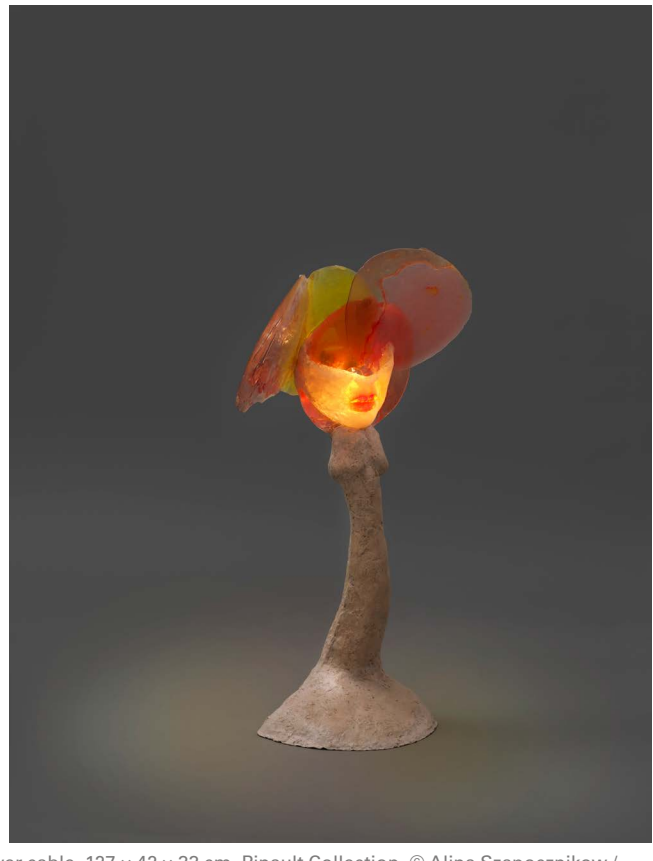
Sculpture-lampe IX, 1970. Coloured polyester resin, light bulb, and power cable. 127 \times 42 \times 33 cm. Pinault Collection. © Alina Szapocznikow / ADAGP, Paris, 2023

Sculpture-Lampe XII, ca. 1970. Coloured polyester resin, light bulb, and power cable. 63.5 x 35.6 x 19.7 cm. Private collection. © Alina Szapocznikow / ADAGP, Paris, 2023. Courtesy The Estate of Alina Szapocznikow / Piotr Stanisławski / Galerie Loevenbruck, Paris / Hauser & Wirth / Photo: Fabrice Gousset