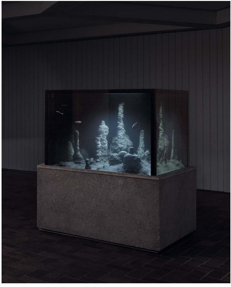
Living marine ecosystem, aquarium, Astyanax\ mexicanus (with and without eyes), algae, concrete mould, interchangeable black glass, geolocalised programme 165 × 138.5 × 124 cm. © Pierre Huyghe / ADAGP, Paris, 2023. Courtesy Pierre Huyghe / Esther Schipper, Berlin / Photo: Andrea Rossetti

Circadian Dilemma (El Dia del Ojo) is based on the possibility of an involution: can fish without eyes who are exposed for the first time ever to an alternation of day and night recover their sight? The work places a school of tetras in deep water conditions, in a dark aquarium full of bare concretions devoid of any vegetation. This subgroup of fish evolved towards blindness as a result of a geological accident. Trapped in lightless underwater grottoes, they gradually lost their sight as they were removed from the succession of day and night, what we call the circadian rhythm. This consequence of their evolution may be reversible. The artist designed an aquarium whose panes alternate between transparency and opacity, as the liquid coating these glass walls is regulated by an algorithm fed by the surrounding environment (luminosity, climatic data, visibility, etc.). The algorithm "decides" on the change in luminosity within the aquarium.