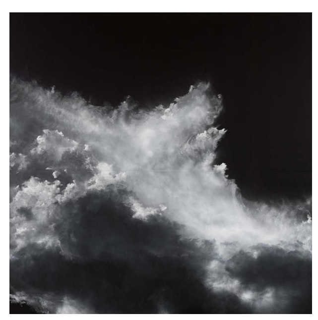
Tacita Dean, Foreign Policy, 2016. Chalk on blackboard, 244 × 244 cm. © Tacita Dean. Courtesy Tacita Dean, Marian Goodman Gallery New York / Paris; Frith Street Gallery, London