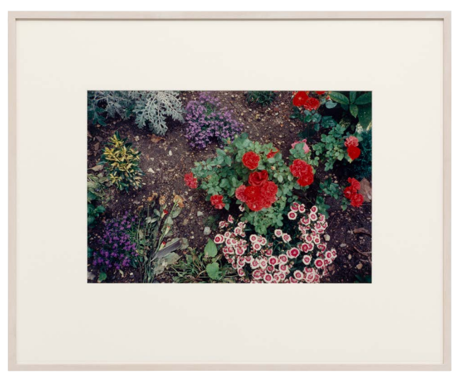
Framed chromogenic print. With frame: 74.3 \times 92.1 cm. Edition of 4, 1 AP.

"Untitled" (Alice B. Toklas' and Gertrude Stein's Grave, Paris), 1992