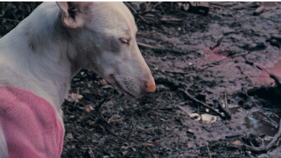
HD colour video, sound/ HD colour video, sound, 14'. © Pierre Huyghe / ADAGP, Paris, 2023. Courtesy Pierre Huyghe / Pinault Collection

Pierre Huyghe has come to stand at the forefront of the exploration of our relationship to the non-human in art. He dwells specifically on the time of the artwork and our relationship to the material. Huyghe proposes environments instead of objects, characterised by an evolution over time which resembles that of a living being.