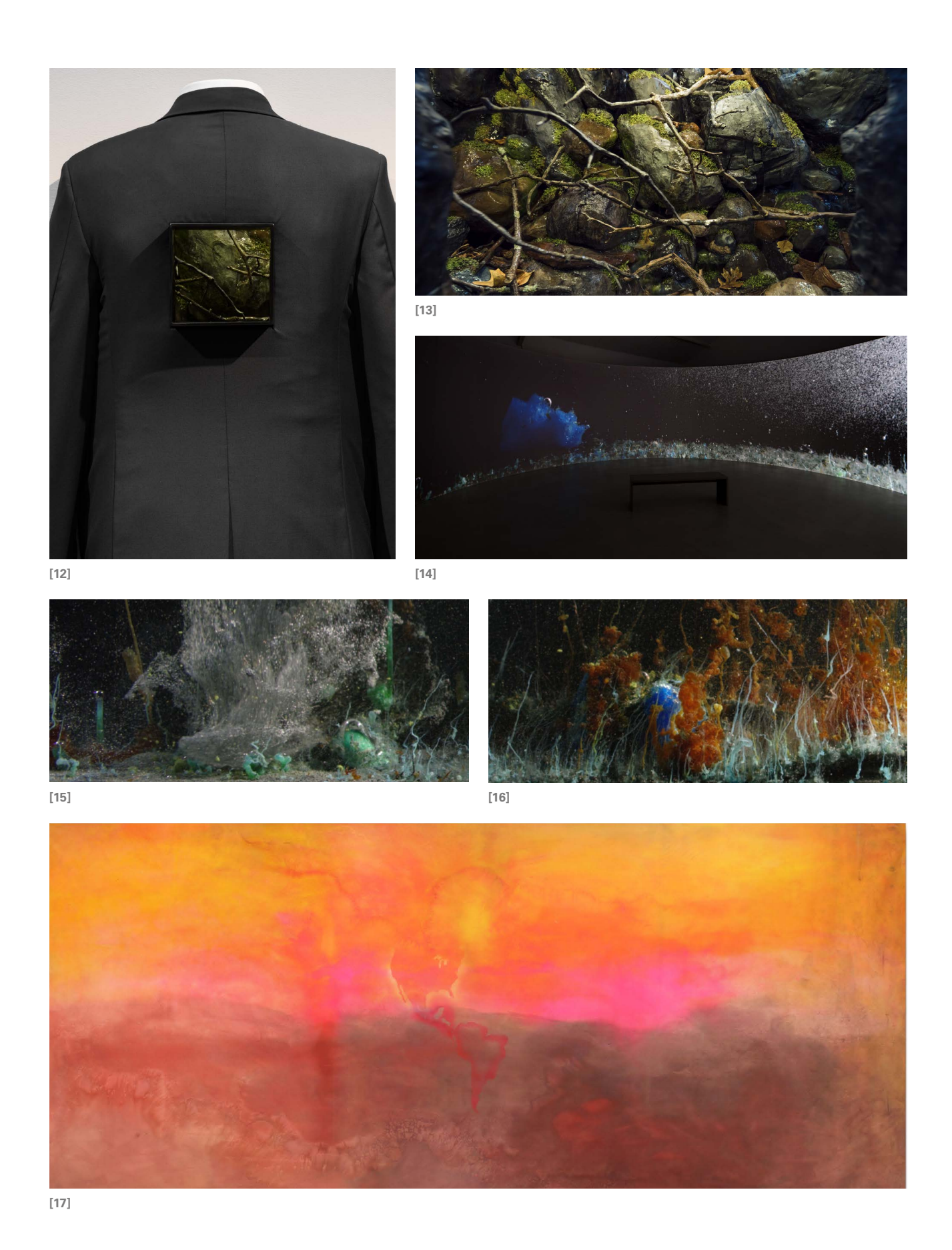
[12] [13] Robert Gober, Waterfall, 2015–2016. Pinault Collection. Detail. Wool, cotton, wood, paint on epoxy putty and resin, recycling pumps, lights and water. 292 × 170 × 163 cm. © Robert Gober, Courtesy Matthew Marks Gallery. Photo: Fredrik Nilsen. [14] [15] [16] Hicham Berrada, Présage, 2018. Pinault Collection. Still. video installation with synchronized video projectors. Pinault Collection. 8'25". Dimensions variables. © Hicham Berrada / Adagp, Paris, 2023. Photo: Archives kamel mennour. Courtesy the artist and Kamel Mennour. [17] Frank Bowling, Texas Louise, 1971. Pinault Collection. Acrylic on canvas. 282 × 665 cm © Frank Bowling. Courtesy the artist and Hauser & Wirth. Photo: Charlie Littlewood © Adagp, Paris, 2023