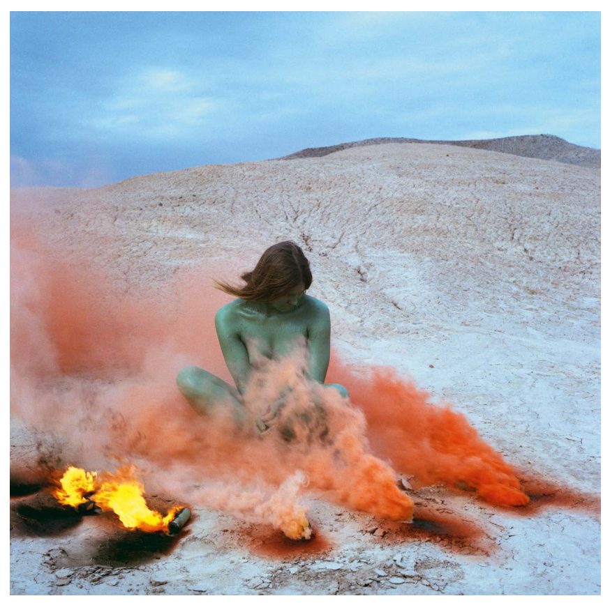
Immolation, from Women and Smoke, 1972, remastered in 2016. MP4 video. Duration: 14'45".

Women and Smoke, California, 1971–1972, remastered 2016