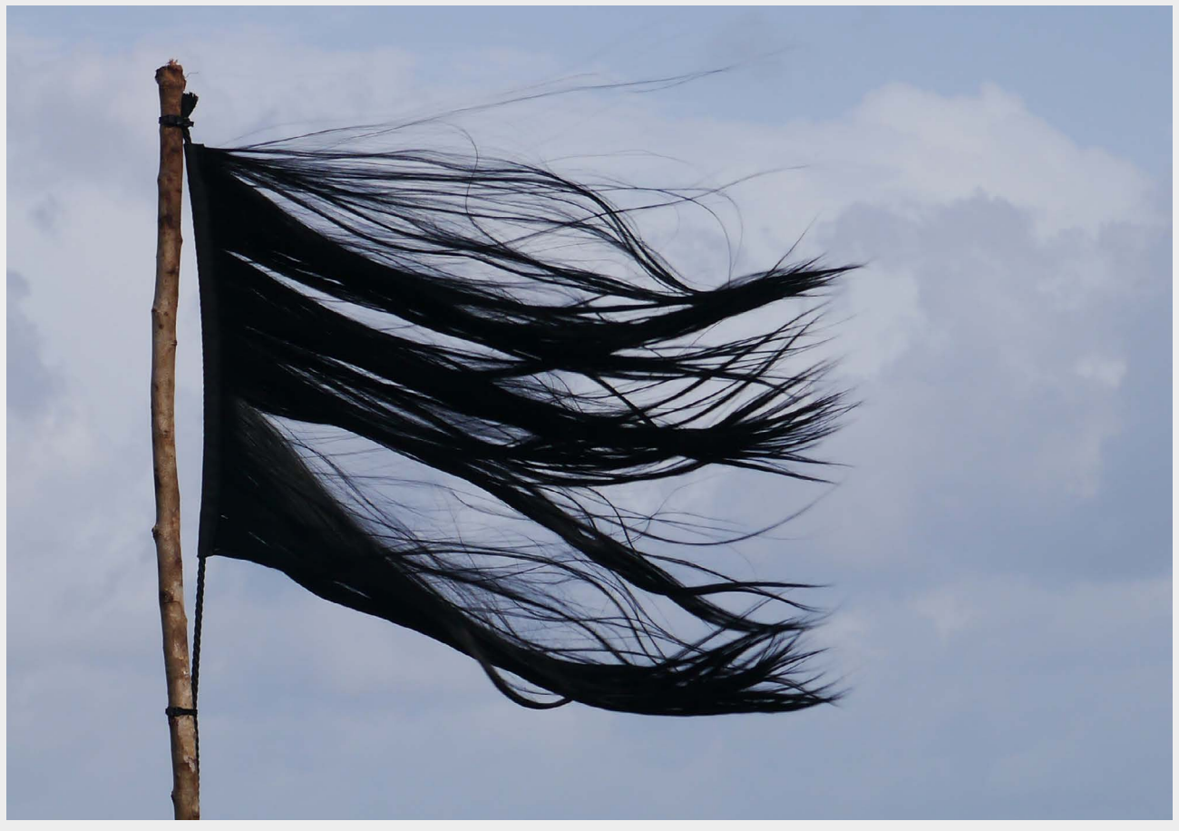
Ombre indigène, 2014

L'origine des choses, 2023 Curated by Emma Lavigne and Alexandra Bordes