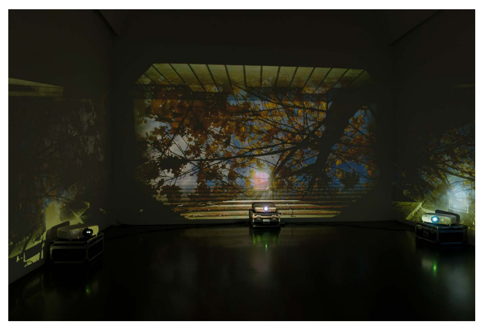
Video installation, six projectors, six players. 14'27". Pinault Collection. © Diana Thater. View of the exhibition "The Sympathetic Imagination", MCA Chicago, 29 October 2016 – 8 January 2017.

Chernobyl, 2011 White is the Color, 2002