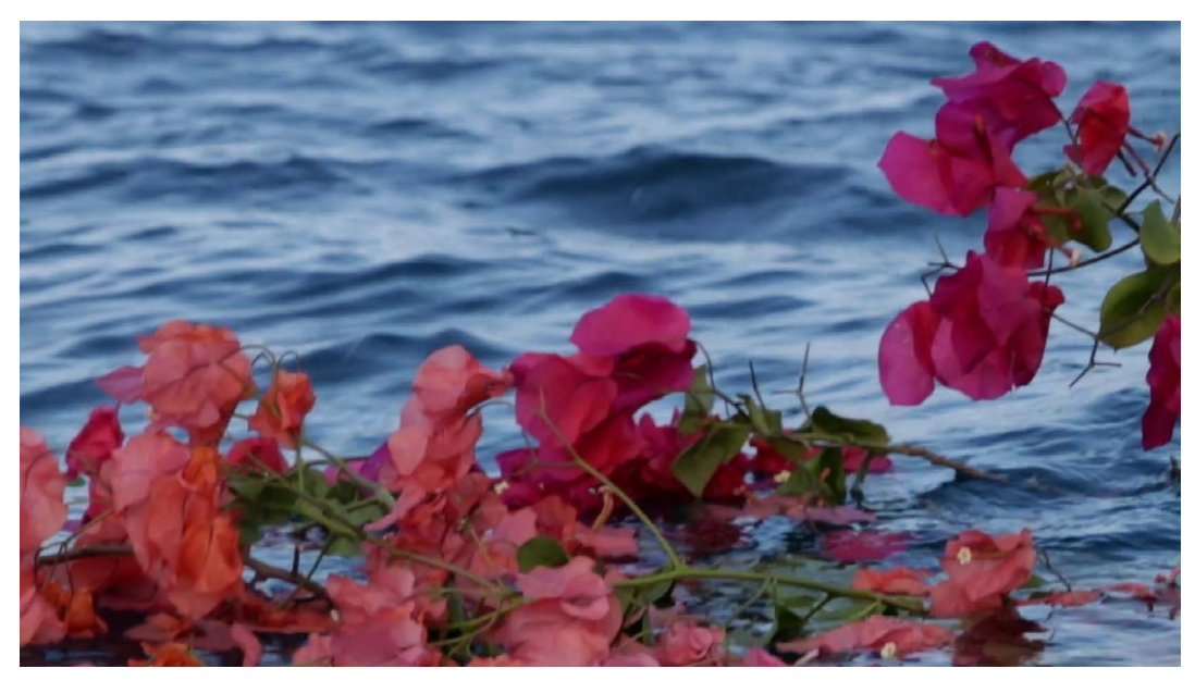
Video installations, variable dimensions. © Dineo Seshee Bopape. Courtesy Dineo Seshee Bopape / Commissioned and produced by TBA21–Academy

lerato laka le a phela le a phela le a phela / my love is alive, is alive, is alive, 2022