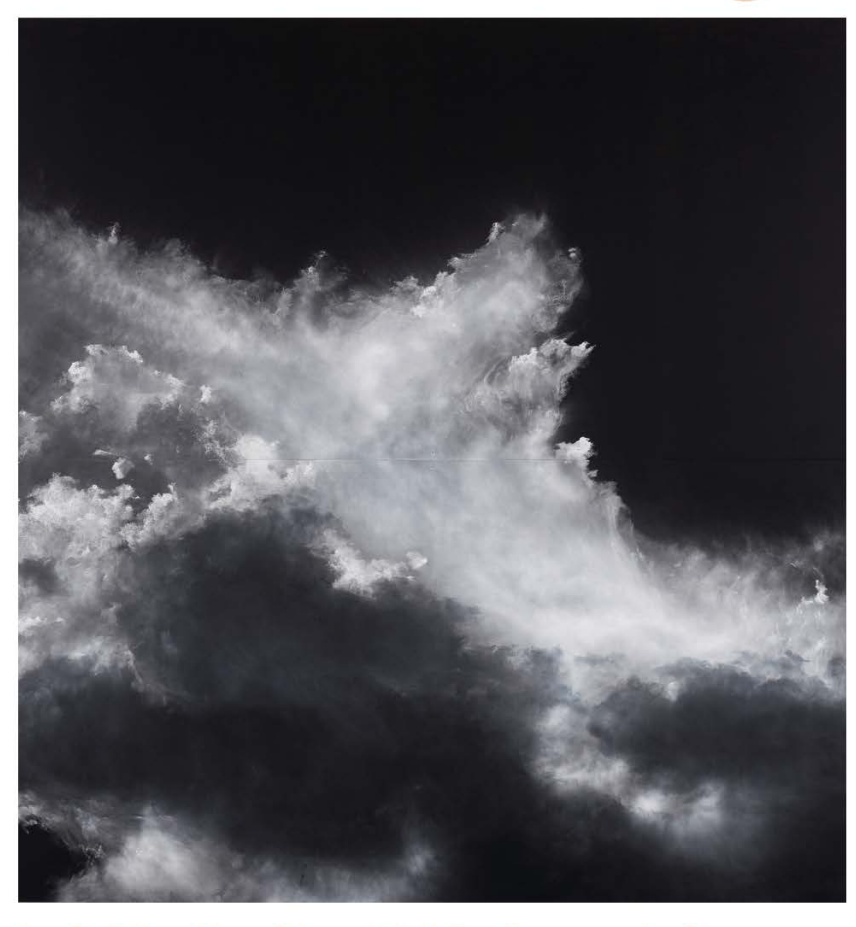
La Collection Pinault à la Bourse de Commerce

Published jointly by the Bourse de Commerce — Pinault Collection and éditions Dilecta, the Before the Storm exhibition catalogue is a bilingual, collective effort.