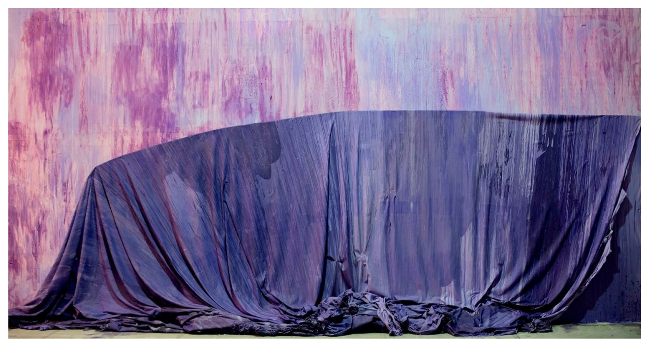
Pénétrable, 2017. Rubber residue and pigment, on-site installation.

Les Couleurs du gris, 2022–2023 Pénétrable, 2023