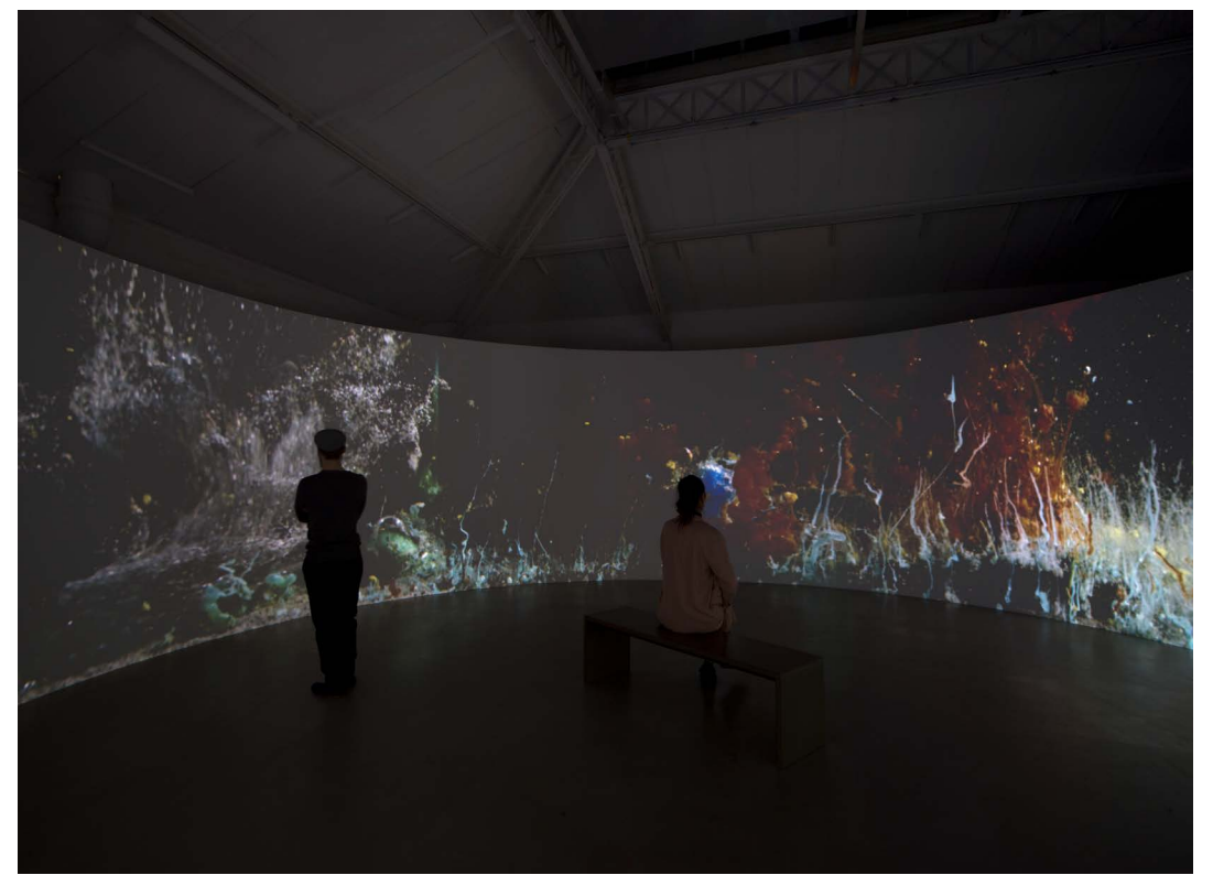
Video installation with synchronised video projectors. 8'25". Pinault Collection. © Hicham Berrada / ADAGP, Paris, 2023 Courtesy Hicham Berrada / kamel mennour / Photo: DR

Présage immerses viewers in a changing visual universe. Forms, halos, outgrowths, spores, and filaments appear, developing constantly, as if the artist were filming the sped-up growth of plants in real time. They are in fact metals submerged in an aquarium that are in the process of degrading and transforming at the hands of corrosive, toxic substances in the tank. This unstable, altered state gives birth to colours and forms that resemble new forms of life, as if they were a proliferating coral reef that is as poisonous as it is superb.