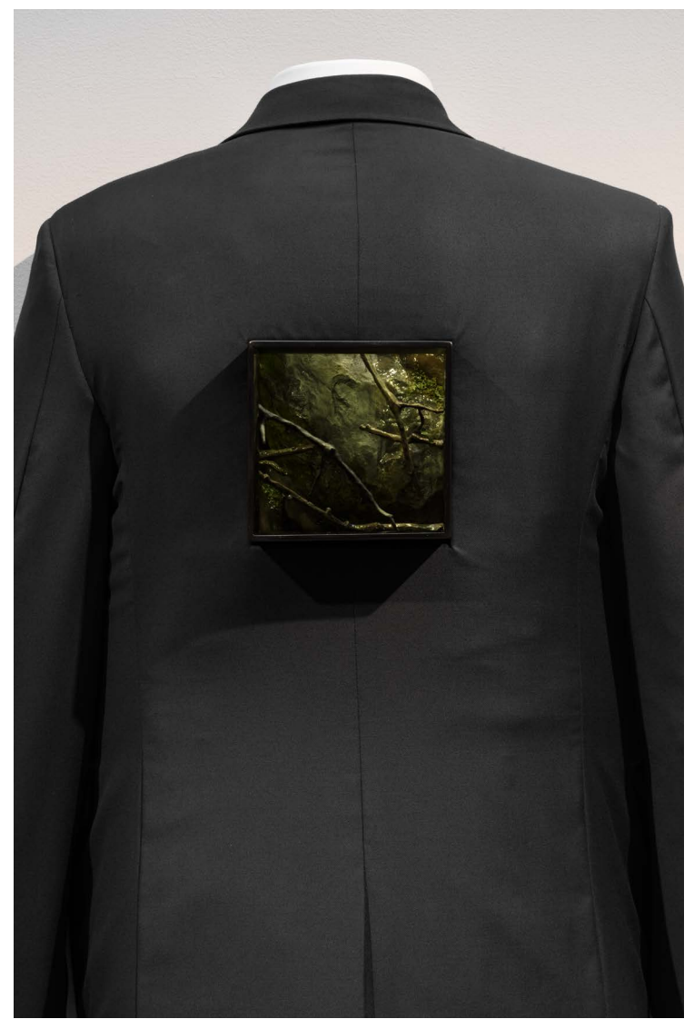
Wool, cotton, wood, painting on epoxy mastic and resin, recycling pumps, lights, and water. 292 \times 170 \times 163 cm Pinault Collection. © Robert Gober. Courtesy Robert Gober / Matthew Marks Gallery / Photo: Fredrik Nilsen

Robert Gober's works describe the complex relations between the interior and exterior, the hidden and the revealed. Male bodies are presented as modified, truncated, mutant, and hybrid ready-mades.