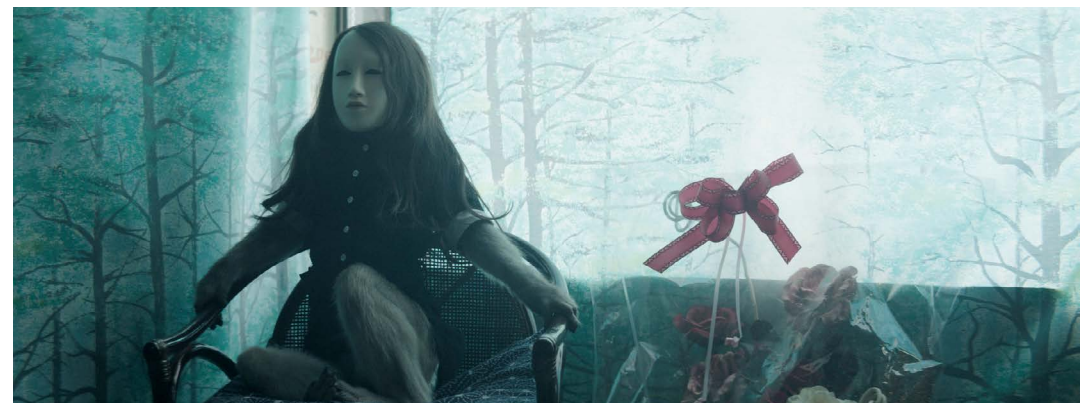
Colour film, stereo sound, 2:66 format, 19'7". Pinault Collection.

Human Mask continues this inquiry into the boundary between nature and culture. Filmed in part in the abandoned area around Fukushima, Human Mask follows the wanderings of a monkey dressed and masked as a human; the fact that its attitudes are so close to ours casts a constant doubt as to its true nature. For Pierre Huyghe, the animal "plays the game of the human condition, endlessly repeating an unconscious role". Here the human mask also refers to the constructed nature of human identity; it renders the monkey's inner life visible to us, making it appear similar to own. The last time it looks into the camera at us, it appears to be a full-fledged interlocutor, a fellow human being. The film's apocalyptic ambiance depicts the blurry outlines of a future world in which the boundary between the human and the non-human is not so clear. Who thus among us is "wilder?"