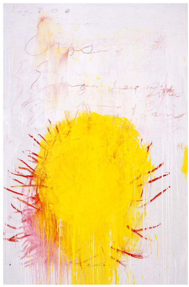
Part III (series of 10 panels): Acrylic, wax crayon, lead pencil on canvas. 206.1 x 136.5 cm [Cat. 119]. Pinault Collection © Cv Twombly Foundation

An emblematic work by American painter Cy Twombly (1928–2011), and a highlight of the Pinault Collection, the Coronation of Sesostris is a digression on a Pharaoh's mystical voyage that is as sombre as it is celestial. The series depicts a changing solar cycle, in which the life of the Pharaoh becomes blurred with that of the God Ra, whose voyage defines the passage of day into night, from the world of the living to that of the dead. The reddening sun becomes a nave, the boat in the myth of Osiris in the Book of the Dead, the colours gradually darkening across the series... unless we are looking at an eye that opens and then closes. The oars remain at rest, like so many eyelashes of a shut eyelid. As is often true of Twombly's works, the images are enriched with citations from ancient or contemporary poems, some concerning our relationship to lost religions, others evoking the fluctuations of our desires. The Coronation of Sesostris portrays an uncertain cycle in which each element seems as if it could be something else.