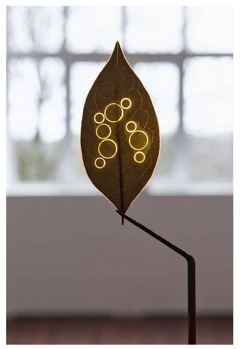
Dried leaves (Ficus elastica japonicum), metal base, slide projection, laser-cut metal slide, varying dimensions.

Breathing Lines, 2023 Elegancia y Renuncia, 2011 Geometric Nature / Biology, 2022